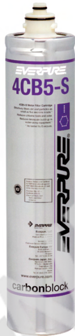
4CB5-S Replacement Cartridge: EV9617-21

Delivers quality water for foodservice, vending and OCS applications